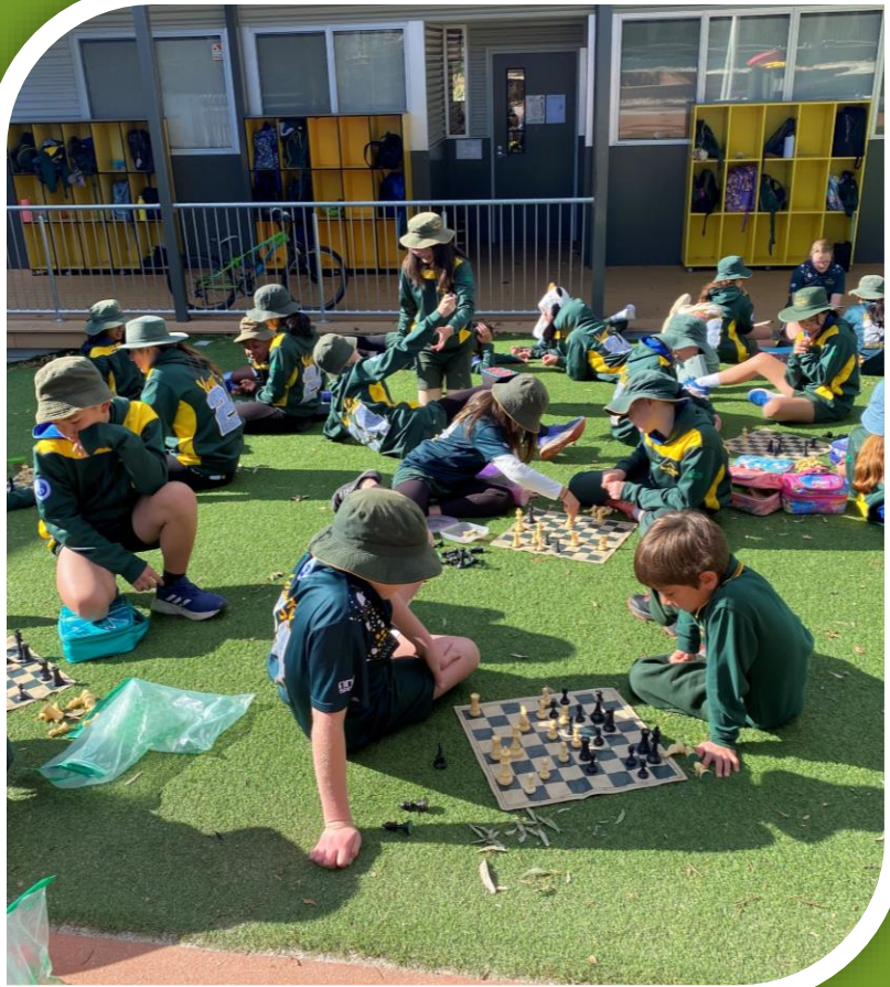
'Students enjoying chess club at lunch'